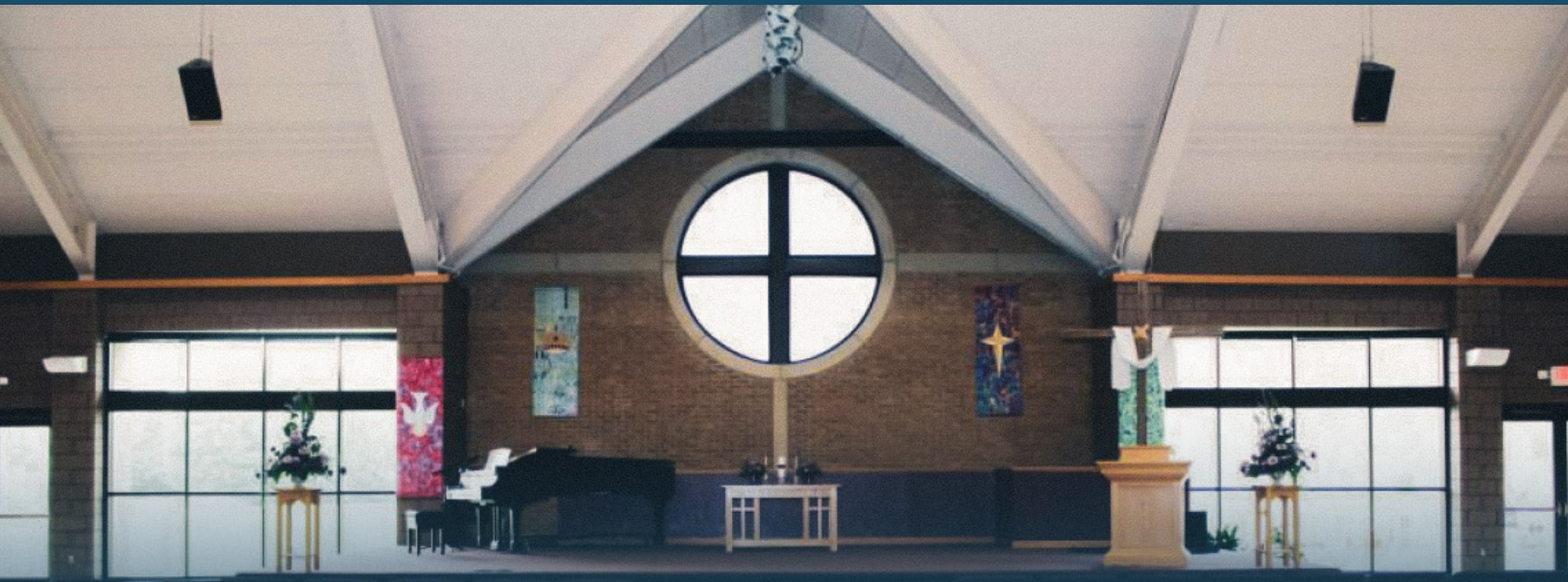
The auditorium of Ward Church's newest campus in Farmington Hills.